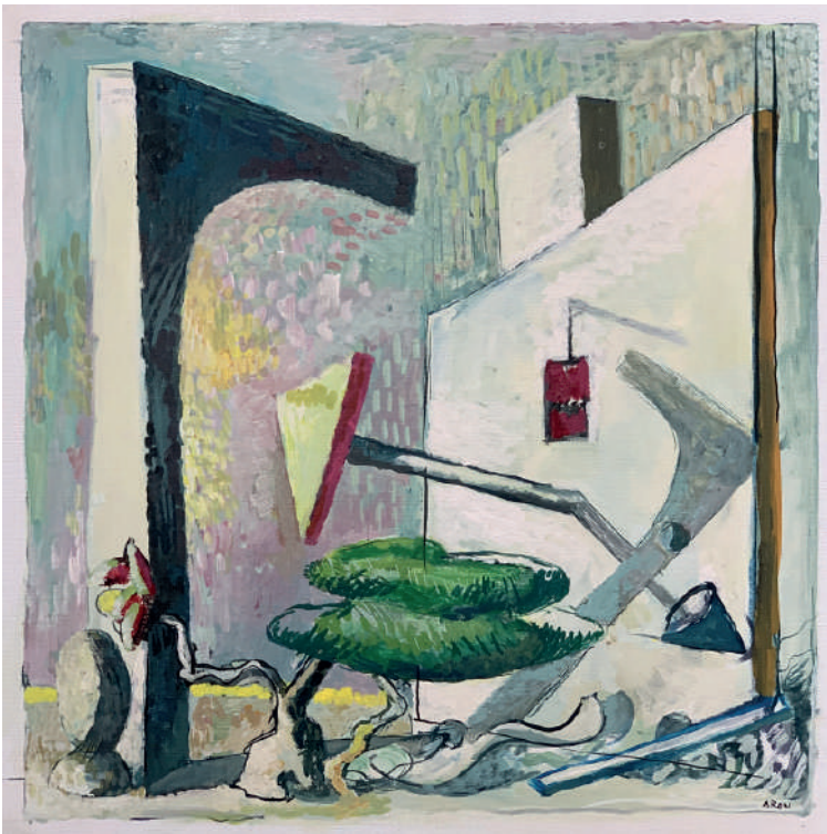
Un arbre chinois 2023 - Acrylic on canvas 60 x 60 cm

The association Les 4 Arts Paris Centre presents: