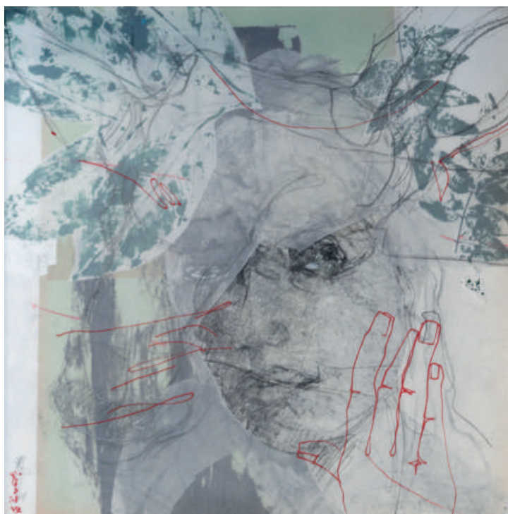
Metamorphoses 2022- Collage, monotypes and drawing on paper and PVC 40 x40 cm